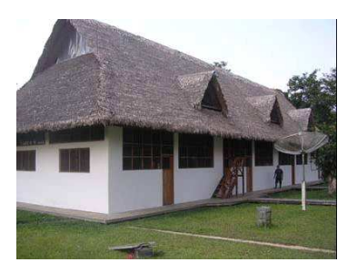
Laboratory at CICRA

With support from the National Geographic Society, ACEER will expand current facilities at CICRA to accommodate groups of up to 20 course participants in