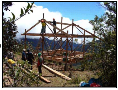
First cabin under construction at the Wayqechas Research Station

new administrator at Waygechas. He plans to have the first three cabins available this April 2006. Three teams are working busily on the cabins, competing among themselves to deliver the best product. The station will receive its first visitors in April.