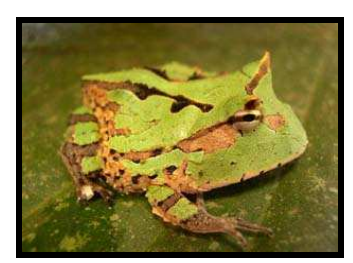
Ceratophrys cornuta This frog species found in Los Amigos lays up to 1000 eggs at a time and wraps them around aquatic plants.